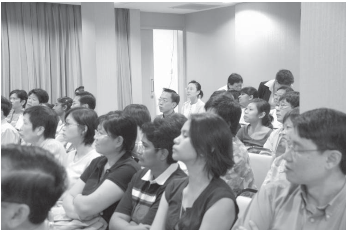
Lunch Lecture at Thomson Medical Centre