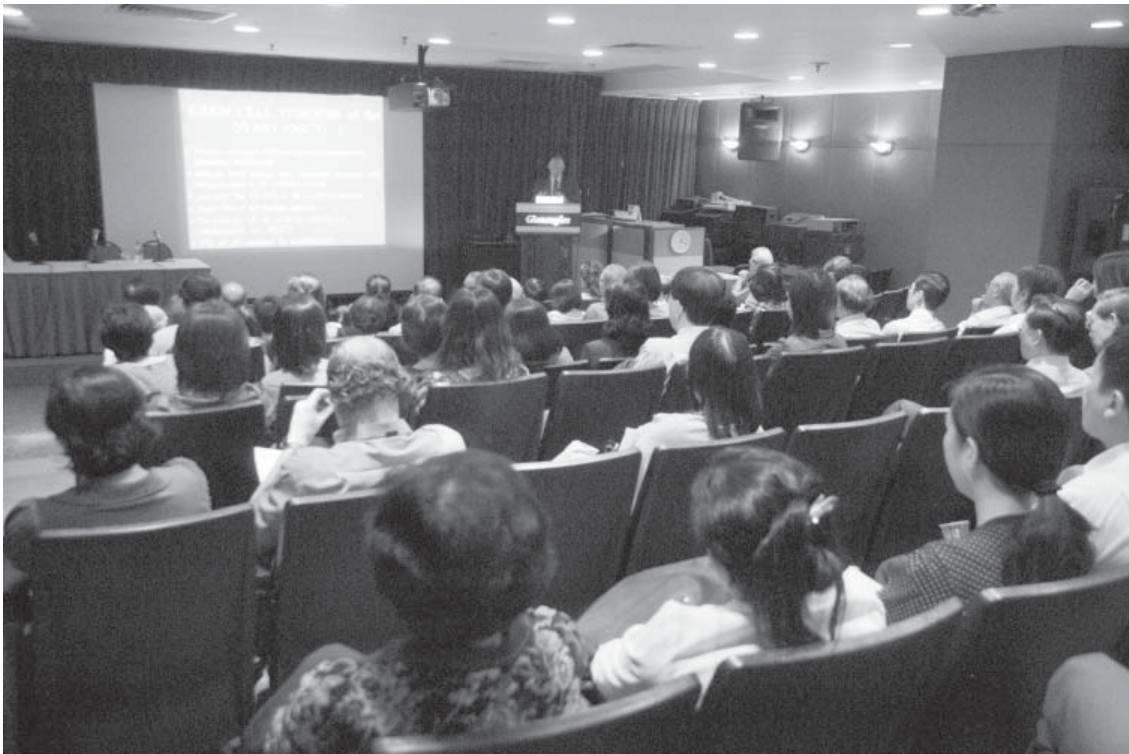
Lunch Lecture at Gleneagles Medical Hospital