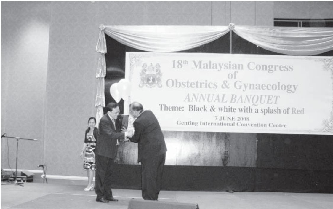
Exchange Token between OGSS & OGSM