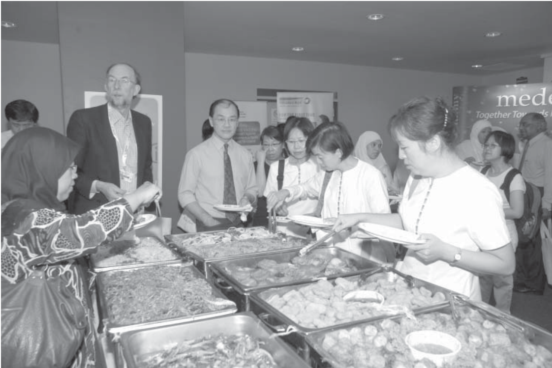
Lunch Lecture at Mount Elizabeth Hospital