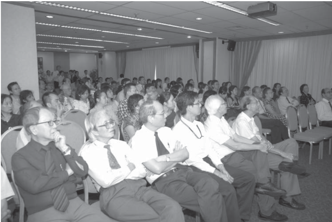
Lunch Lecture at Mount Elizabeth Hospital